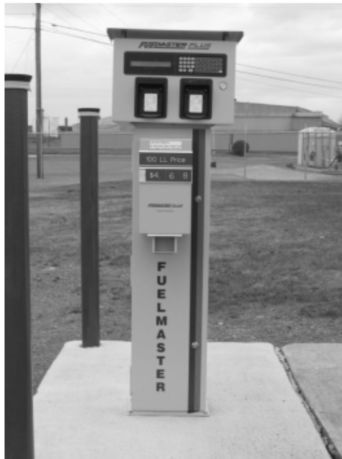
Credit Card Pump